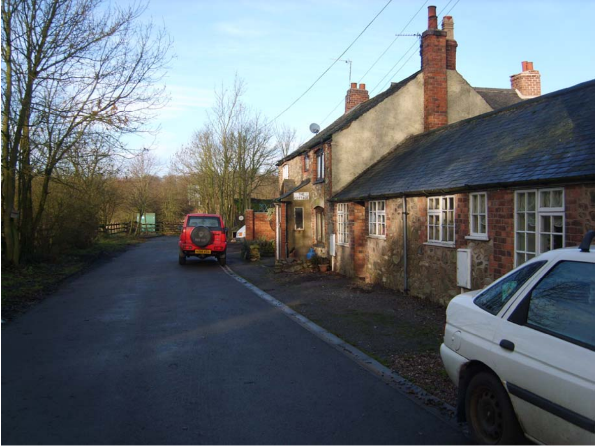
Figure 4 Location of NO 2 Diffusion Tube on Façade of End Cottage, Copt Oak