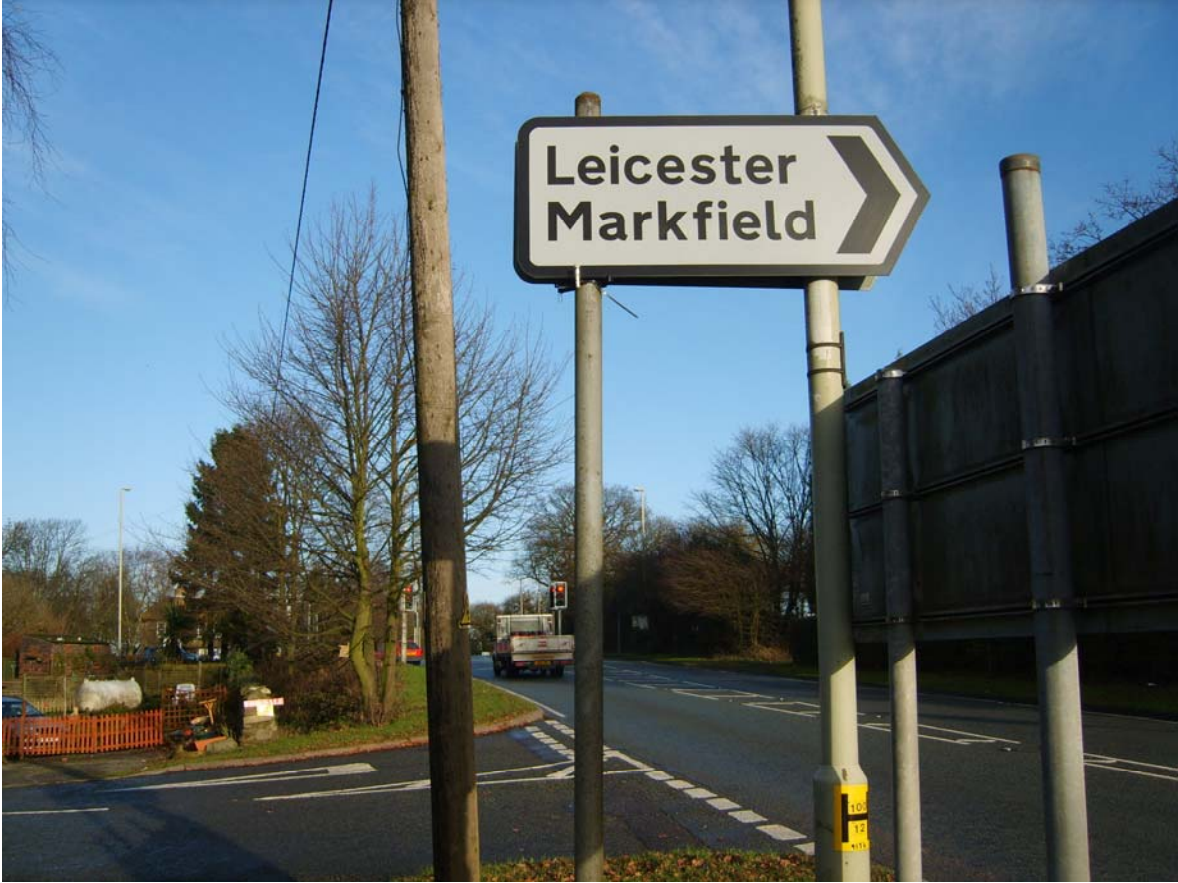
Figure 5 Location of Highways Agency NO 2 Diffusion Tubes, Copt Oak Road