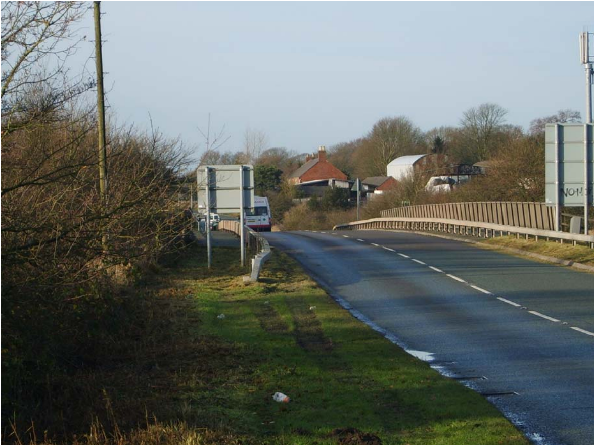
Figure 3 Warren Hills Road in Copt Oak illustrating the location of North West Leicestershire District Council's Copt Oak (21) NO 2 Diffusion Tube