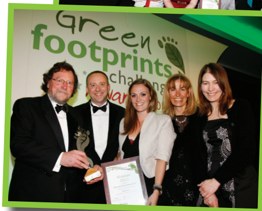
Pictured above: All winners from this years awards. Below: Award sponsors Quadrant Events present the owners of the Donington Park Farmhouse Hotel with their award.