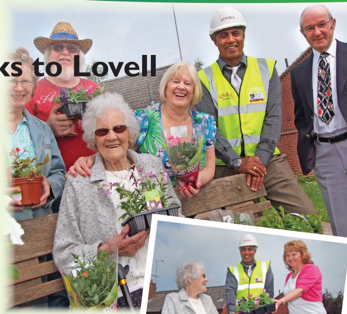
Residents say thanks to Lovell for getting Smith Court looking its best!