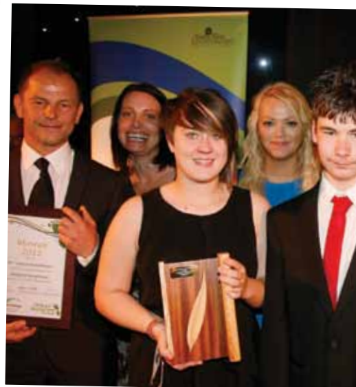
Sponsors of the Green Footprints Challenge 2012