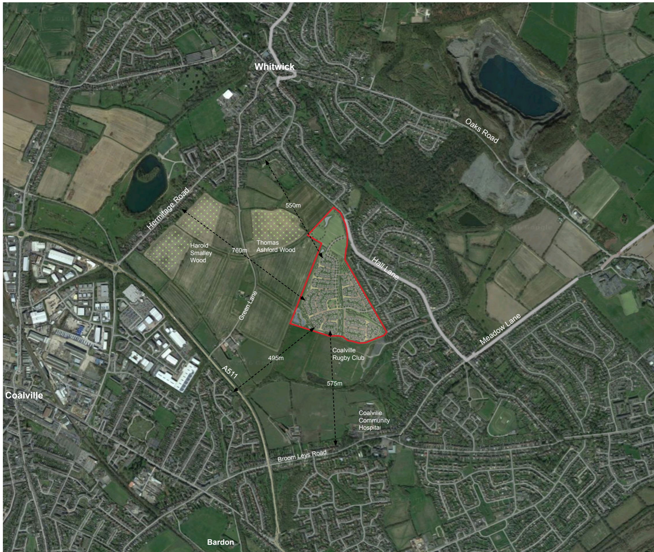
J:\7500\7532\LANDS\Plans\7532 Appeal Scheme Overlain on Aerial Photograph REV A.indd

Approximate distances between existing and proposed dwellings