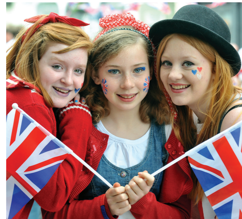
Celebrating the Queen's Diamond Jubilee, Ashby de la Zouch