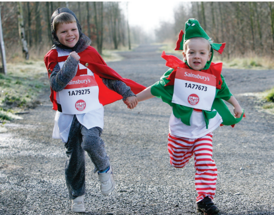
Run for Sport Relief, Hicks Lodge