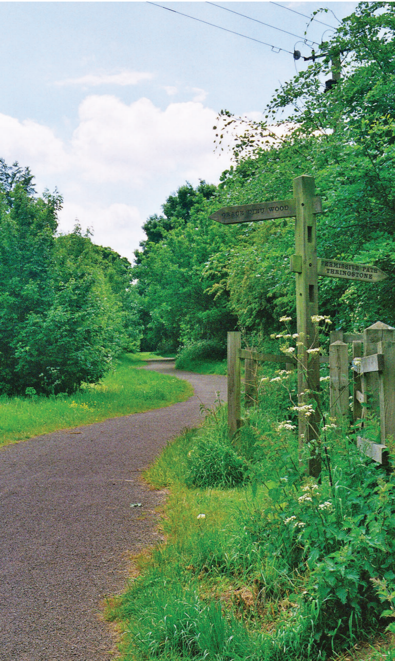
Path to Grace Dieu Wood, Thringstone

Each of the actions set out in this Plan will be monitored quarterly by members of the Council's Cabinet to ensure we are achieving the high standards we have set. You can check our progress by visiting the performance page of the Council's website www.nwleics.gov.uk/performance