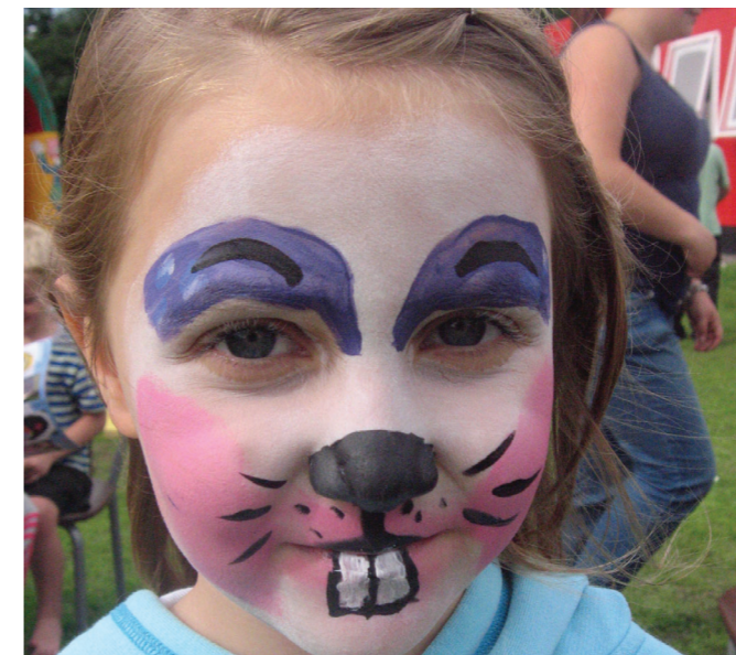
Face painting at Willesley Estate, Ashby de la Zouch