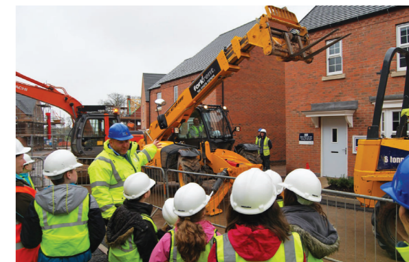
David Wilson Homes at Poppy Fields, Ellistown