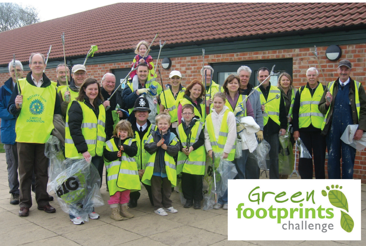
Litter Pick, Castle Donington