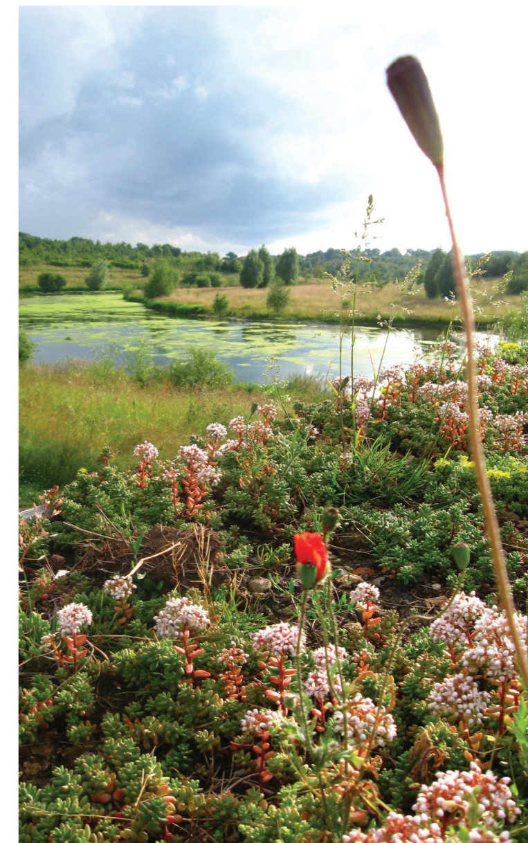
Woodland shelter, Sence Valley Forest Park, Ibstock