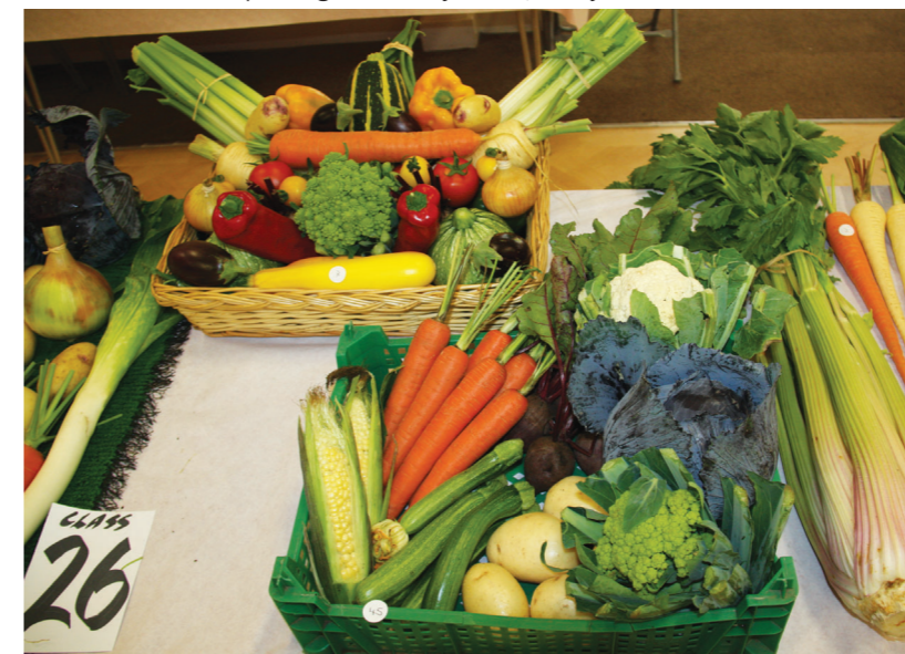
Potential prize winners at the Packington Show, Packington