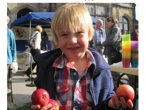
Apple Day celebration at Ashby de la Zouch