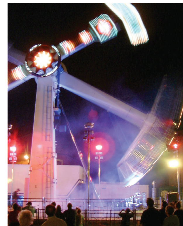
Ashby Statutes Fair