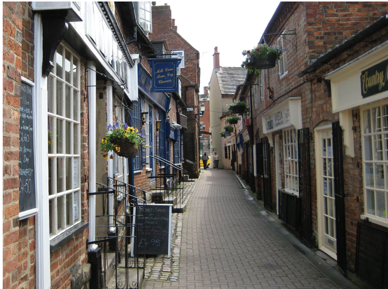
Shopping in Ashby de la Zouch