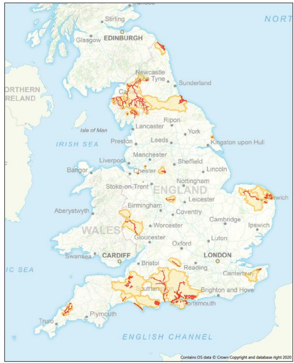
Annex B: National Map of Catchments

European protected sites requiring nutrient neutrality strategic solutions Nutrient neutrality SSSI catchments