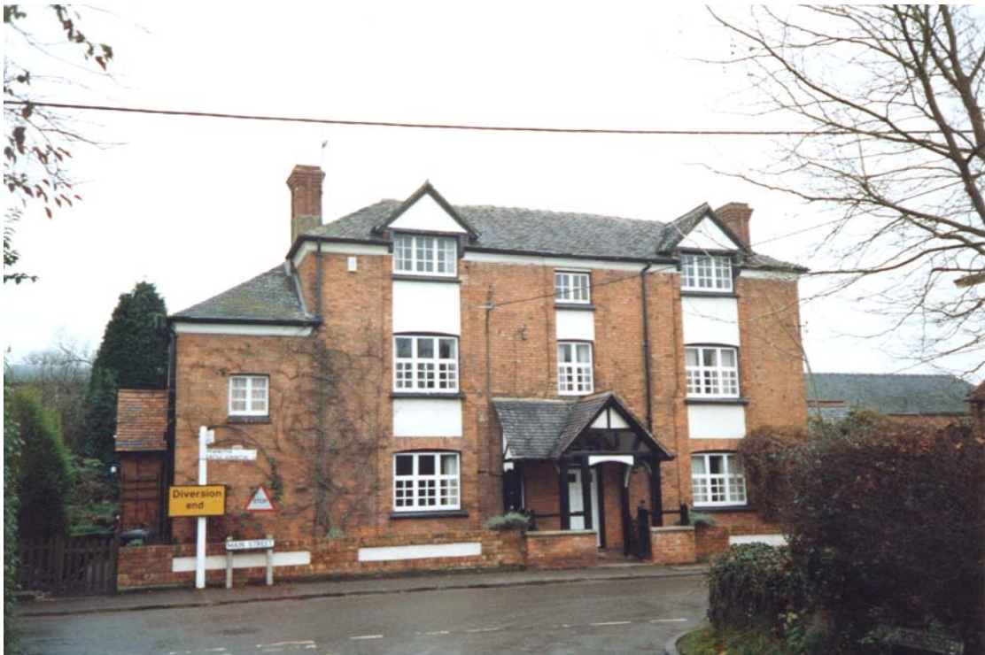
Post Office Farmhouse, Main Street, Lockington