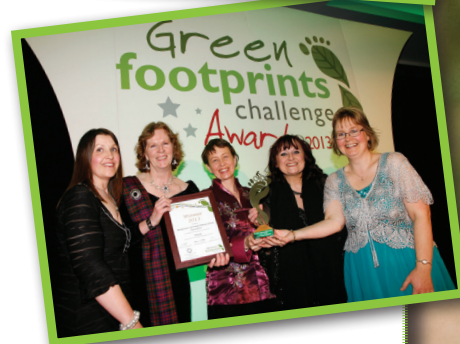
Pictured above: Award sponsors Ourplace presents Blackfordby St Margaret's School with YMD Boon Ltd their award.